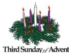
Third Sunday of Advent

Advent Wreath 3rd CANDLE – (pink) THE SHEPHERD CANDLE or THE CANDLE OF JOY –This third candle is pink and symbolises rejoicing. During the third week of Advent we are filled with joy for the near arrival of Jesus on Christmas day. This Sunday is often called "Gaudete Sunday" as we reflect on the joy the shepherd's felt at the birth of Jesus.